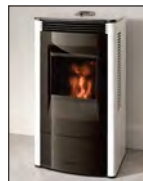
Allure 50 Stylish, powerful & quiet 92 lb. hopper!

FINANCING AVAILABLE TO QUALIFIED CUSTOMERS ASK FOR DETAILS