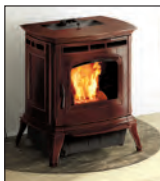
Absolute 63 Industry leading heat & control, heat up to 3400 SF