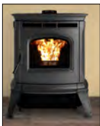
Absolute 43 Heat up to 2400 SF Quiet, compact & powerful; dual fans