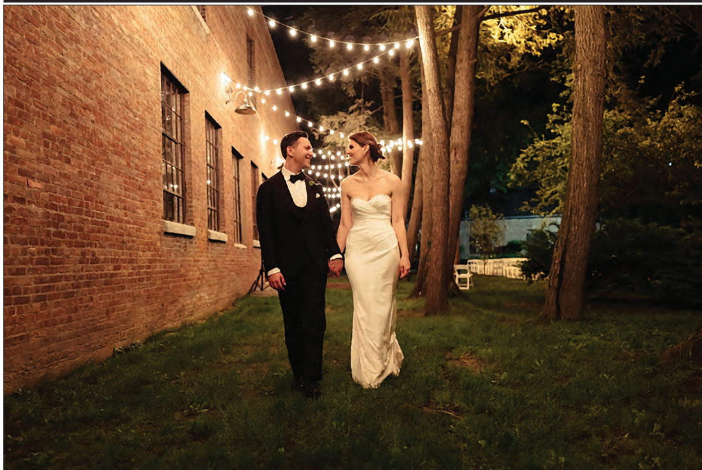
The Senate Garage makes a lovely setting for a wedding.

the riverside enhances its allure, offering guests an unmatched view of the rippling Hudson (and its occasional passing boats) as they partake in the revelries. This isn't just a wedding venue: It's a complex of wedding venues amongst other attractions.