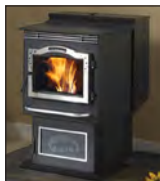
P43 Most compact, powerful P-Series pellet stove