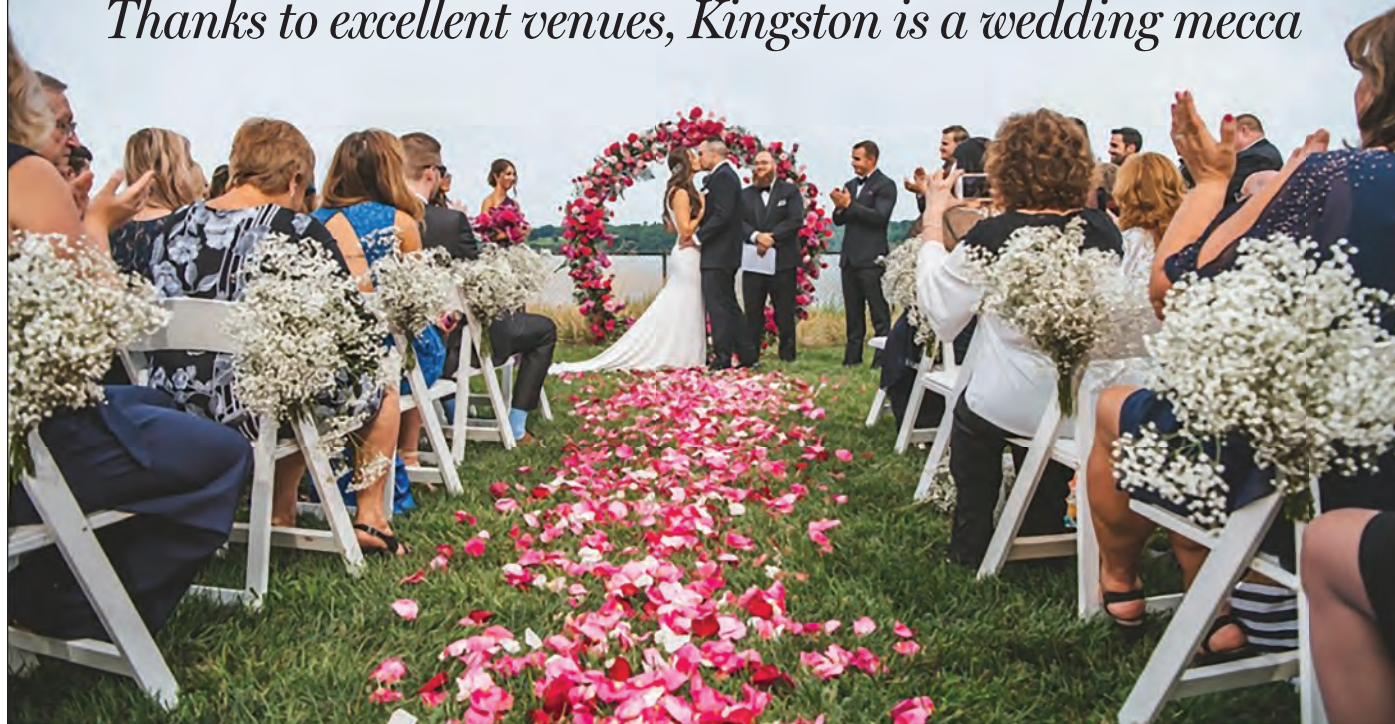
Nuptials at the Hutton Brickyards.

Thanks to excellent venues, Kingston is a wedding mecca