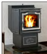
P68 One of the most efficient stoves on the market!