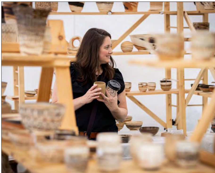
Shopping the Woodstock-New Paltz Arts & Crafts Fair.

The Main Street Market will host live outdoor music, poetry readings, open mics and artist demonstrations, and offer artisan-made gifts, artwork, curated vintage collections, ceramics, sculpture, and more. Street performers and buskers