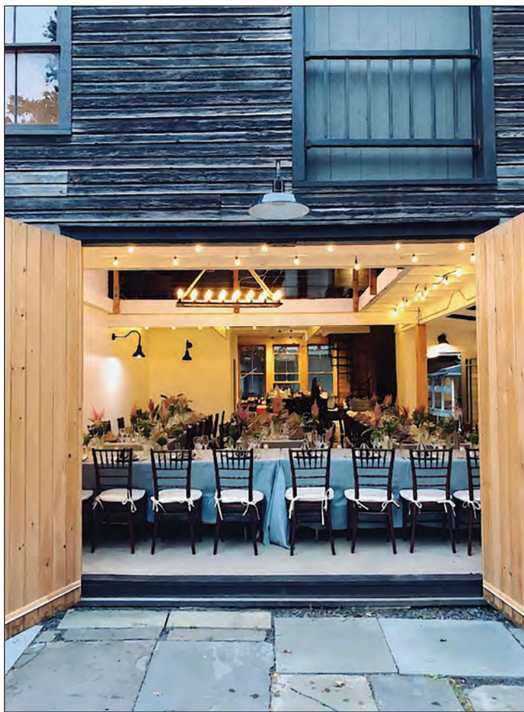
Gettin' hitched at The Forsyth B&B and Barn will be memorable.

No judgment if you just want to show up, tie the knot, and get on with your wedded bliss. The carefully restored Midtown building is historically significant and architecturally quite pleasing, so you won't be disappointed with your wedding day selfies. Love doesn't cost a thing.