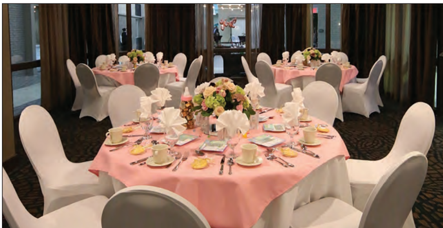
Elegant table settings at The Venue Uptown.

The Chateau's culinary team is versatile, with deep experience in creating custom menus. From delectable hors d'oeuvres and elegant plated meals to indulgent